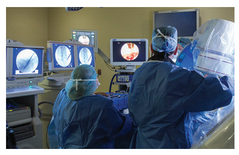
Minimally invasive spine surgery enables the trained surgeon to operate through a 1-inch incision with tubular retractors — which shortens recovery time.

As an alternative to traditional spine fusion - which can lock the vertebrae and increase risk of future herniation at other levels - the spine surgeons also use artificial disc technology to preserve the rotational motion of the vertebrae.